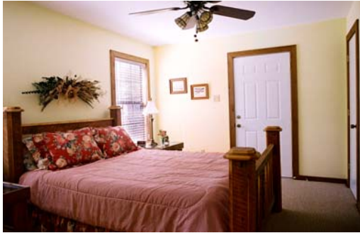
A nice place to rest your head

Fox Meadows offers four guest homes that can sleep up to four each. Our guest homes offer a full kitchen, wood-burning fireplace and an outdoor dining area. There's even a TV and VCR if the birds, animals and flowers can't hold your attention.