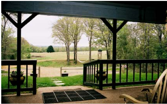
The view from the rocking chairs

As you turn down the dirt road to the guest houses of Fox Meadows, you can leave the worries of everyday life behind you.