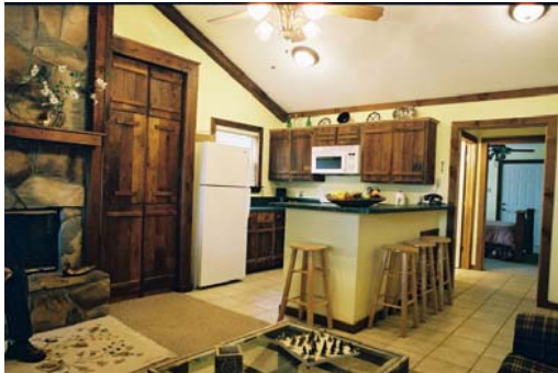
All the amenities of home

Fox Meadows offers four guest homes that can sleep up to four each. Our guest homes offer a full kitchen, wood-burning fireplace and an outdoor dining area. There's even a TV and VCR if the birds, animals and flowers can't hold your attention.